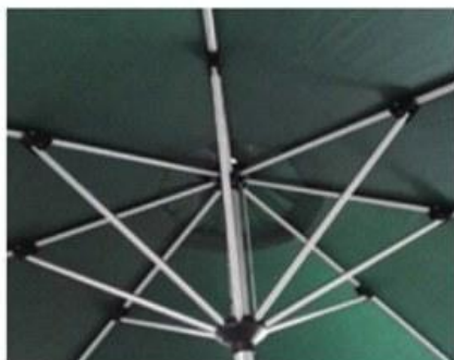
strong metal rib