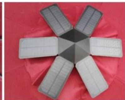
strong metal rib